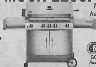
NAPOLEON GOURMET GRILLS Award Winning Products