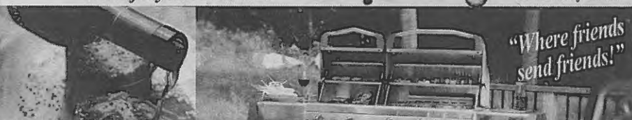
"Where friends send friends!"

12320 Gouin Blvd. West, Pierrefonds - (between sources & St. Jean)