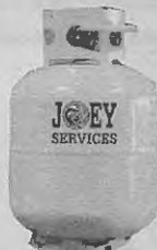
Tanks a lot and have a grate day!

35 th anniversary Why pay costly tank exchange prices as high as $29.95! WE REFILL YOUR TANK FOR MUCH LESS!