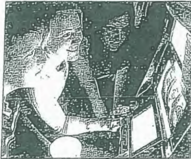
Youth is gambling away futures

Howard P Riback www.theribackgroup.com 514 659 5621 - The Riback Group "The Cleaner"